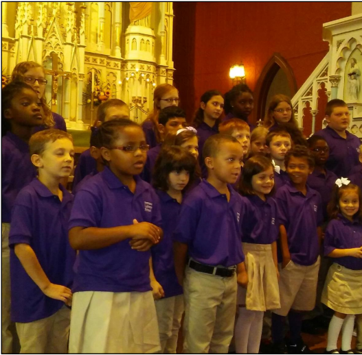
All School Sing