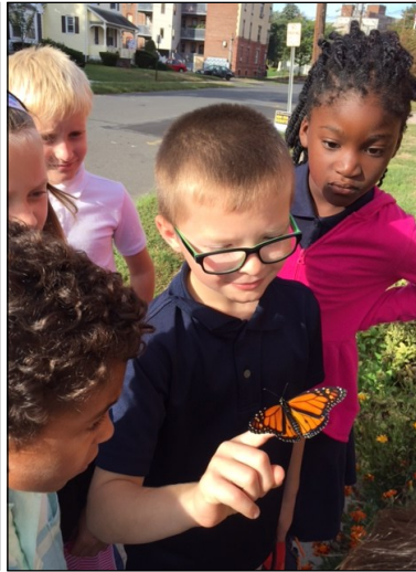
Our Butterfly Garden