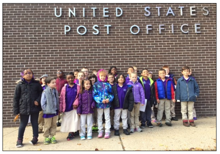
K-3 Community Walking Field Trip — On November 17 Immanuel students in Kindergarten through Grade 3 walked around the community. While the students in Grades 2 and 3 practiced their mapping skills by writing in street and building names as they walked, the Kindergarten and 1st grade children were seeing the community helpers they have been studying in class.