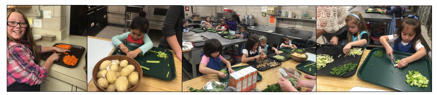
Girl Scout Troop #66072 made two soups — meatball tortellini & chicken vegetable — that were served at the Advent Lunch on November 30. What a great group of workers!

For more information contact Becky Wells at 860-916-3621 or Trina Theriault at 860-384-1530