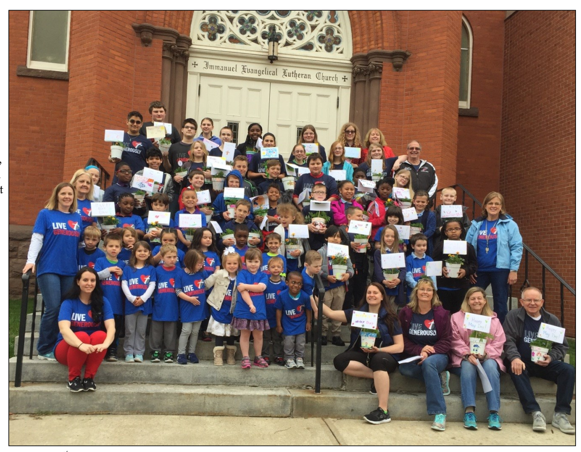
On May 1<sup>st</sup> Immanuel students delivered flowers that they grew from seed in pots and decorated with cards that they created for families in the neighborhood.