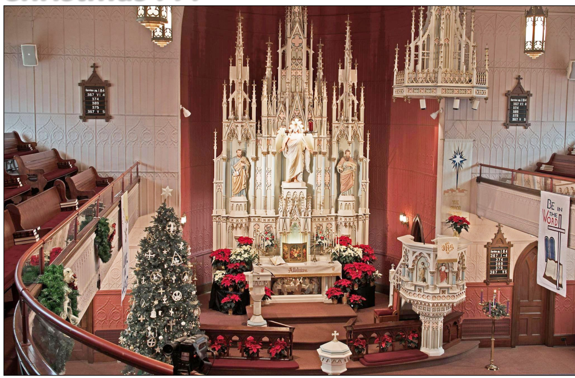
with all our . . .