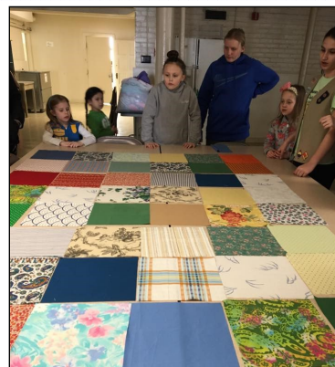
On March 30 th the Girl Scouts made a patchwork quilt for Lutheran World Relief.