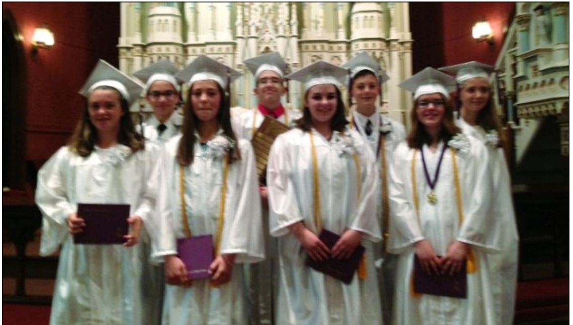
Immanuel Lutheran School — Class of 2015 graduates