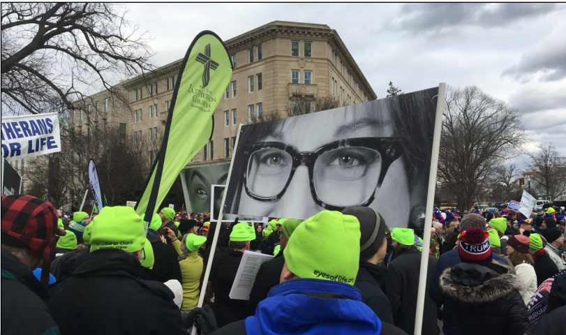
A familiar face marks two of our Eyes of Life banners.