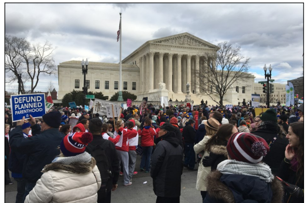
The March ends at the Supreme Court.