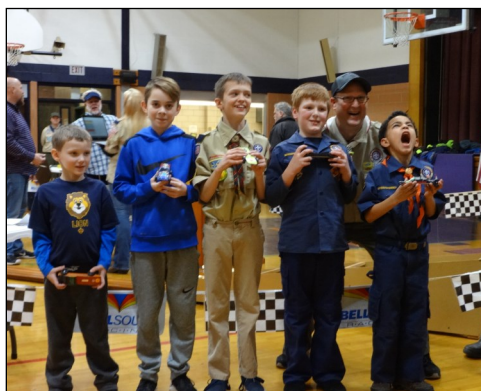
Below, Cub Scout Pack 21 at their Pinewood Derby on January 21 st .

Boy Scout Troop 21 was joined by Cub Scout Pack 21 on February 5 th for our annual observance of Scout Sunday. The scouts looked sharp in their uniforms as they presented a flag ceremony to open and to close the 10:45 Divine Service.