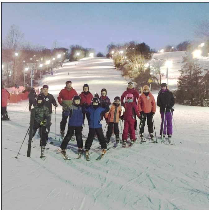
Immanuel Lutheran School Ski Club

Remember to greet one another in church on Wednesdays and Sundays!